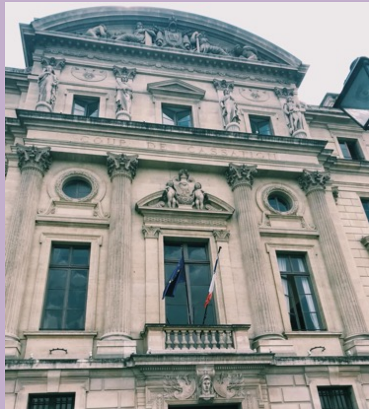
Cour de Cassation